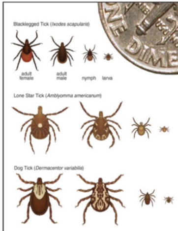
Images of the most common ticks in the United States

The most common ticks in the United States are the black legged ticks (which can carry the organisms known to cause Lyme disease, anaplasmosis, babesiosis, and Powassan disease), Lone Star ticks (which can carry the organisms that cause ehrlichiosis, tularemia and the Southern Tick-Associated Rash Illness (STARI)), and American dog ticks (which can carry the organisms which cause Rocky Mountain spotted fever and tularemia).