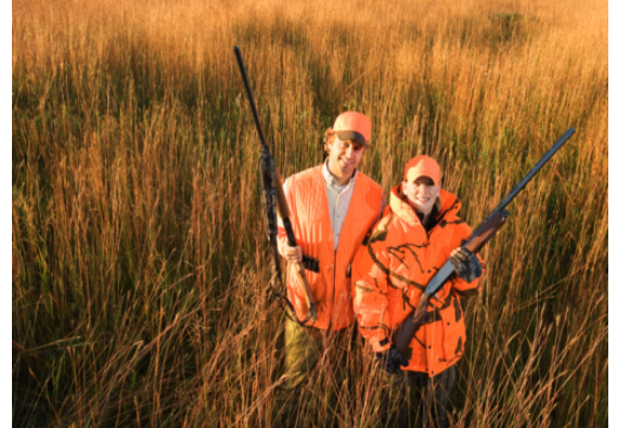
image of Hunters

Ticks can transmit serious and potentially fatal diseases like Lyme disease, ehrlichiosis and tularemia. Many of these illnesses can be treated effectively when caught early, so see your doctor right away if you have a fever, rash or flu-like symptoms after being in tick-infested areas. Frequent tick checks increase the likelihood of finding a tick before it can transmit disease.